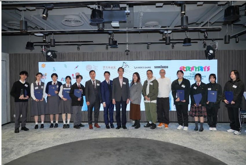
Group photo: Guests and students from the Champion, 1 st Runner-up and 2 nd Runner-up teams.