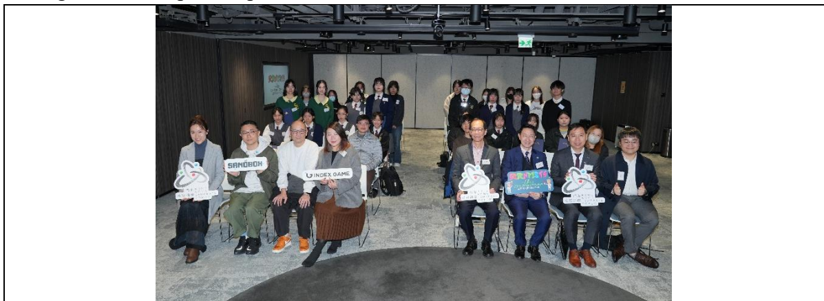
“Scientists and Their Contributions Voxel Art Design Contest” Award Presentation Ceremony concludes successfully today.

For high resolution photos, please click here .